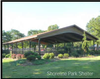
Shoreline Park Shelter