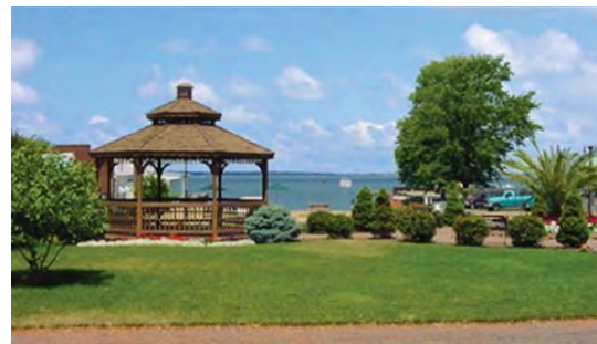
Facer Park Gazebo