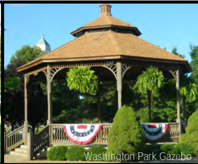
Washington Park Gazebo