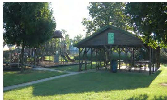
Wightman - Wieber Park