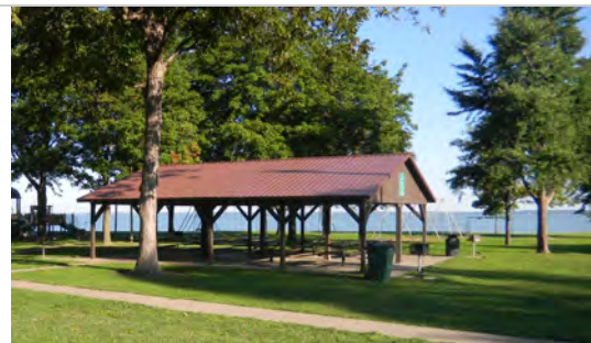
Lions Park North Shelter

Applicant must adhere to the Noise Control Ordinance, Chapter 519 of the Codified Ordinances of the City of Sandusky. This includes amplification equipment and or events involving excessive sound. A copy of the ordinance may be obtained by calling the Police Department at 419.627.5902