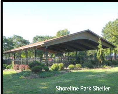
Shoreline Park Shelter