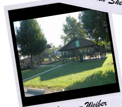
Wightman - Weiber Park Shelter