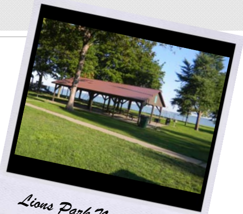
Lions Park North Shelter

Thank you for choosing a City of Sandusky park for your event!