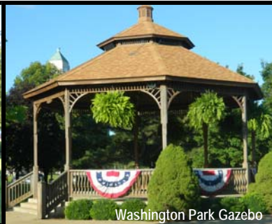
Washington Park Gazebo